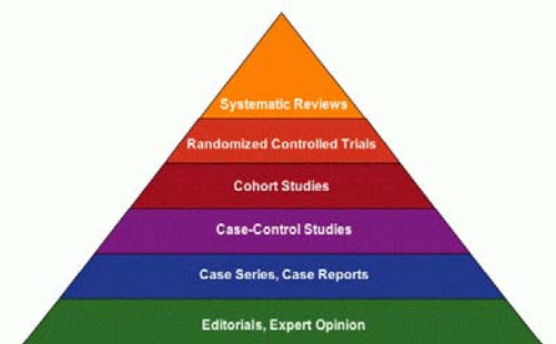
Figure: level of evidence