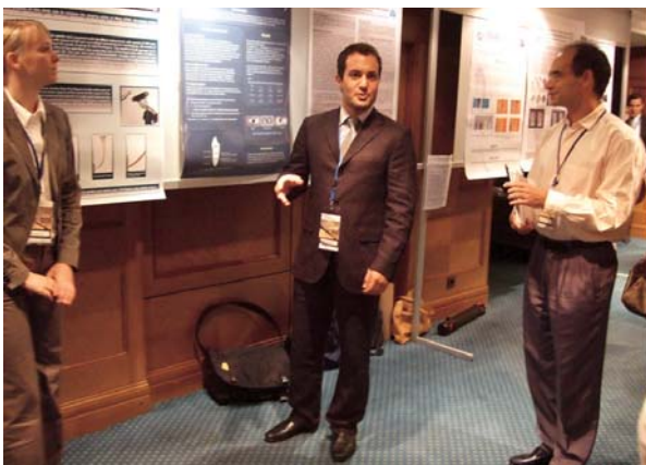
Snapshot from the moderated poster session on research posters.

The central point of the opening ceremony on Thursday morning was the lecture of Izzet Kehribar, who used wonderful and awe-inspiring images from his book "Terra Magica" to describe the beauty and diversity of Turkish landscapes and the local people in their normal course of life. Subsequently, the congress followed its well established format; renowned scientific speakers delivering lectures in the main halls whilst at the same time (mostly) younger colleagues presenting their research and clinical work in moderated poster sessions (Fig. 4) or through oral presentations covering topics from all areas of Endodontology.