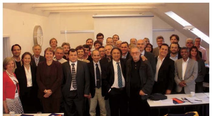
A happy General Assembly at the conclusion of the meeting!!