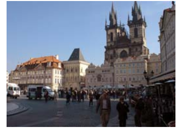
The City of Prague