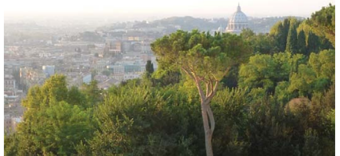
Fig. 1: Sunrise over the eternal city from Monte Mario Hotel Cavalieri.

Rome was a perfect background for the 15th Biennial Congress of the European Society of Endodontology (ESE) which took place in the Monte Mario Hotel Cavalieri from the 14th to 17th September 2011 (Fig 1).