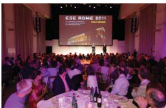
Fig. 16: Spazio 900 – venue for the 2011 gala dinner.