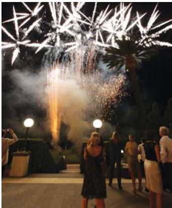
Fig. 15: Fireworks to round-off a glorious evening.