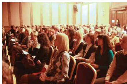
Fig. 1. The participants of annual conference of the LSE, Endodontology 2010.

Last year, the General meeting of members decided to apply for full membership of the ESE. Our application was successful and we were accepted as a full member at the General Assembly of the ESE in Lisbon on 23rd October, 2010.