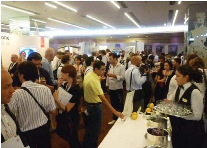
Fig. 4: Refreshments amongst the trade stands... anyone fancy an ice cream?

International Federation of Endodontic Associations (IFEA), by the chairman of the next APEC Congress (Asian Pacific Endodontic Confederation) and the President of the Pan-Arab Endodontic Conference 2012. The organisers and delegates were grateful for the commercial support of a number of companies, including 11 platinum, silver and bronze sponsors, and a total of 26 exhibitors with dedicated booths (Fig 4).