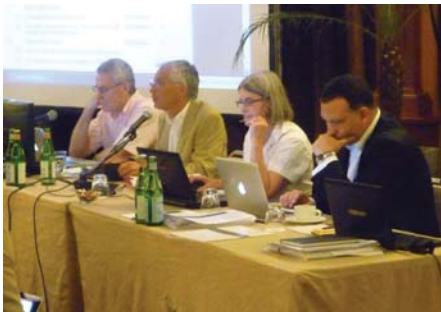
Fig. 5: Executive Board members in the thick of General Assembly business

Making an early start, the ESE Executive Board addressed a full business agenda and received up-to-the-minute news of the Congress throughout Tuesday 13th. In keeping with tradition,