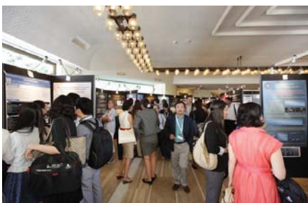
Fig. 9: A full and diverse poster session in progress.

In separate sessions 105 national and international speakers presented on freely chosen topics, while others enriched the meeting further with 139 moderated research posters on a wide range of topics (Fig 9) and 163 clinical posters.