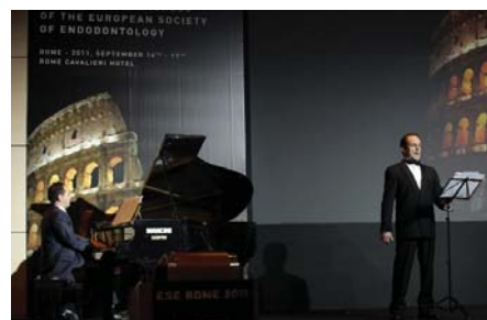
Fig. 7: Italian tenor in full-flight, with "O Sole Mio", followed by "Nessun dorma"