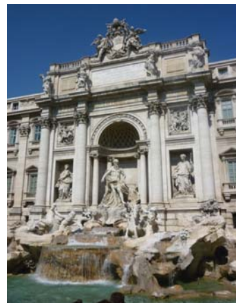
Fig. 11: The Trevi fountain – one of a number of distractions Rome had to offer.

and constructive dialogue between members of the ESE Executive Board and delegates from the American Association of Endodontists (Fig 10). The new Education and Scholarship Committee also commenced its work in revising the ESE undergraduate curriculum guidelines.