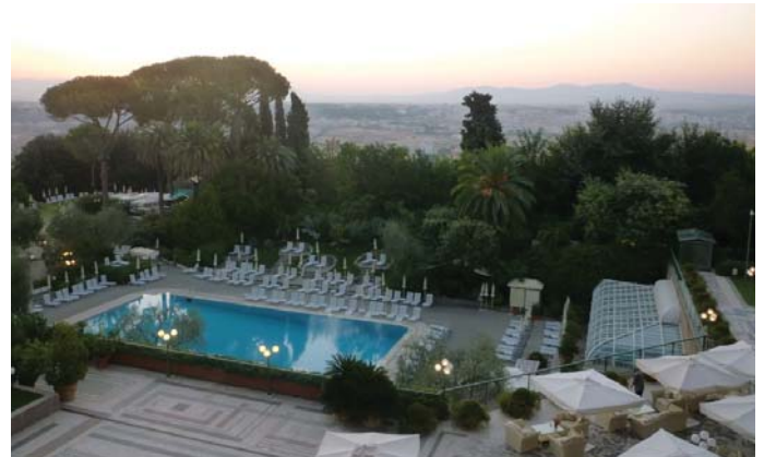
Fig. 6: Sumptuous surroundings for a welcoming evening cocktail!

The day rounded-off with a late afternoon welcome cocktail party in the sumptuous surroundings of the conference hotel (Fig 6).