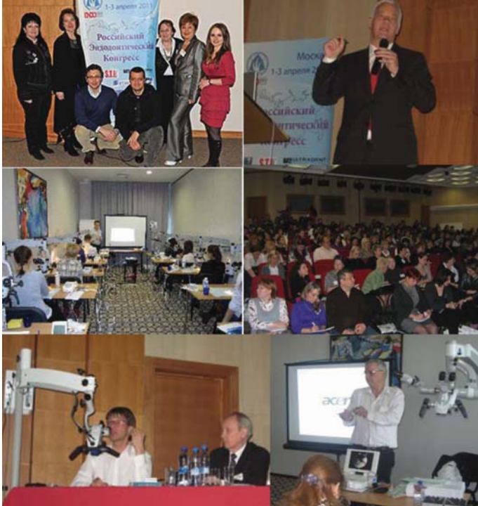
Images from the Russian Endodontic Congress

held on 1st April 2011 at the Milan Hotel, Moscow. The Congress brought together more than 300 specialists from Moscow, Saint-Petersburg, Ekaterinburg, Kineshma, and Vladivostok, along with more than 20 sponsors, and 6 knowledge partners who took part in the exhibition and Congress organization and equipped demonstrations and workshops.